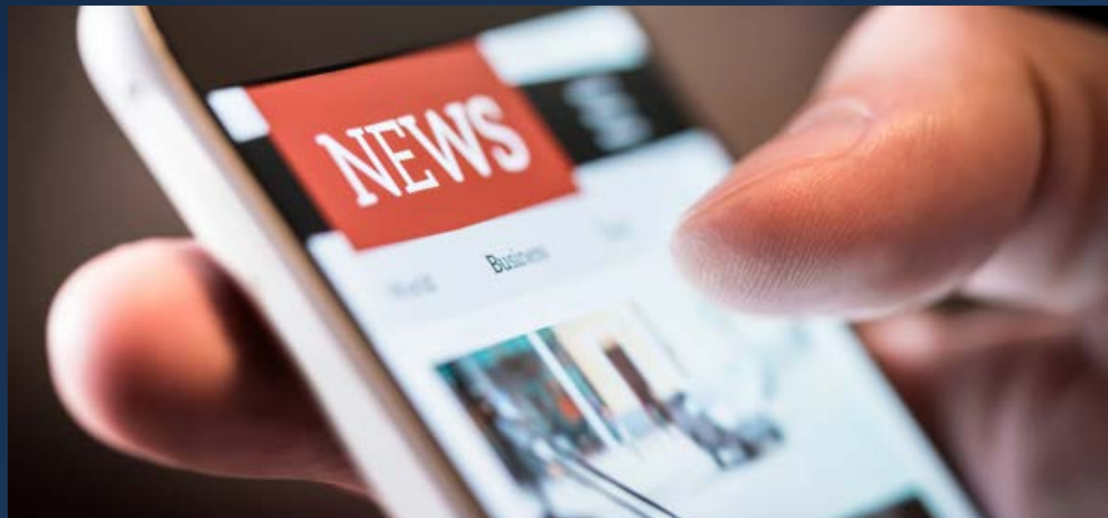
A non-profit company, iShine Cloud, provides a suite of social service sector-specific software via a secured cloud-based platform at a subsidised rate. LIANHE ZAOBAO, 25 JULY 2018