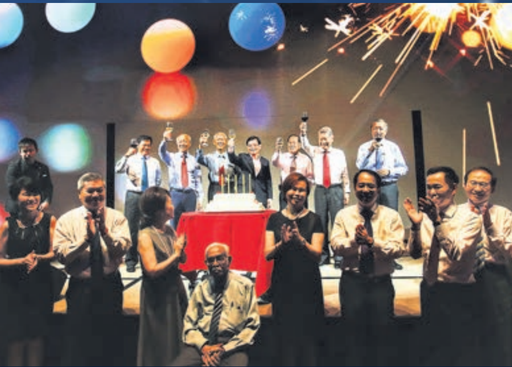
CHARITIES TO RECEIVE HELP WITH IT SERVICES, THE STRAITS TIMES, 22 MAY 2018