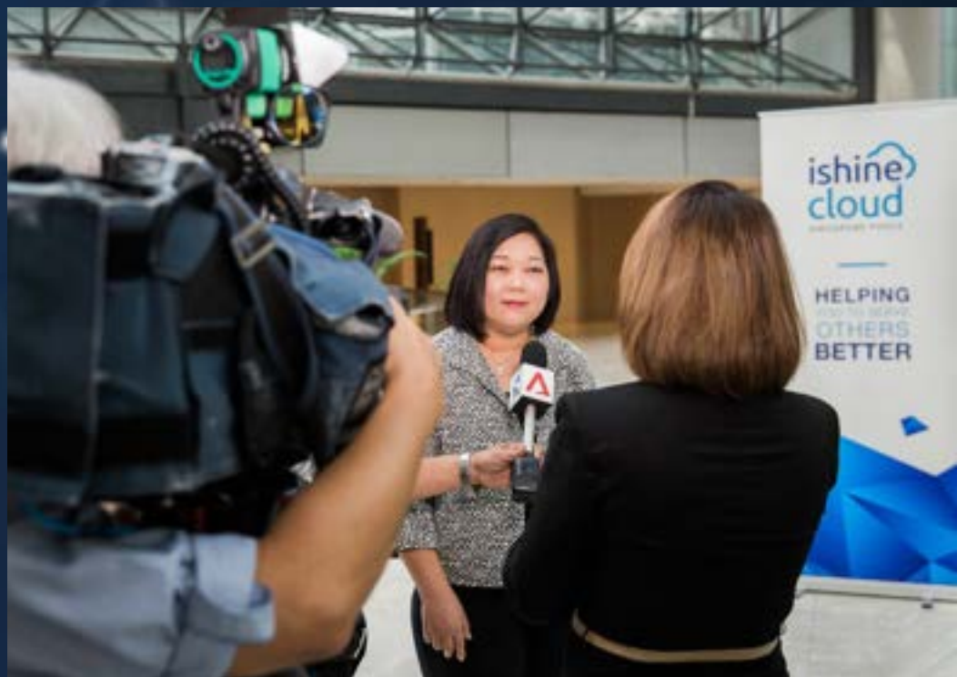
TV, CHANNEL 8, CHANNEL 5, CHANNEL U, CNA, SURIA, VASANTHAM 24 JULY 2018