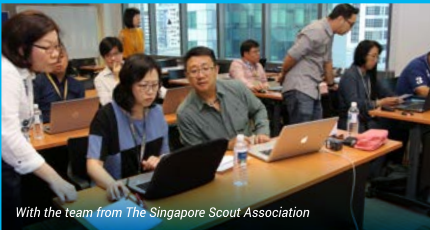
With the team from The Singapore Scout Association

The onboarding team implements a Change Management framework to assist organisations to achieve their desired results