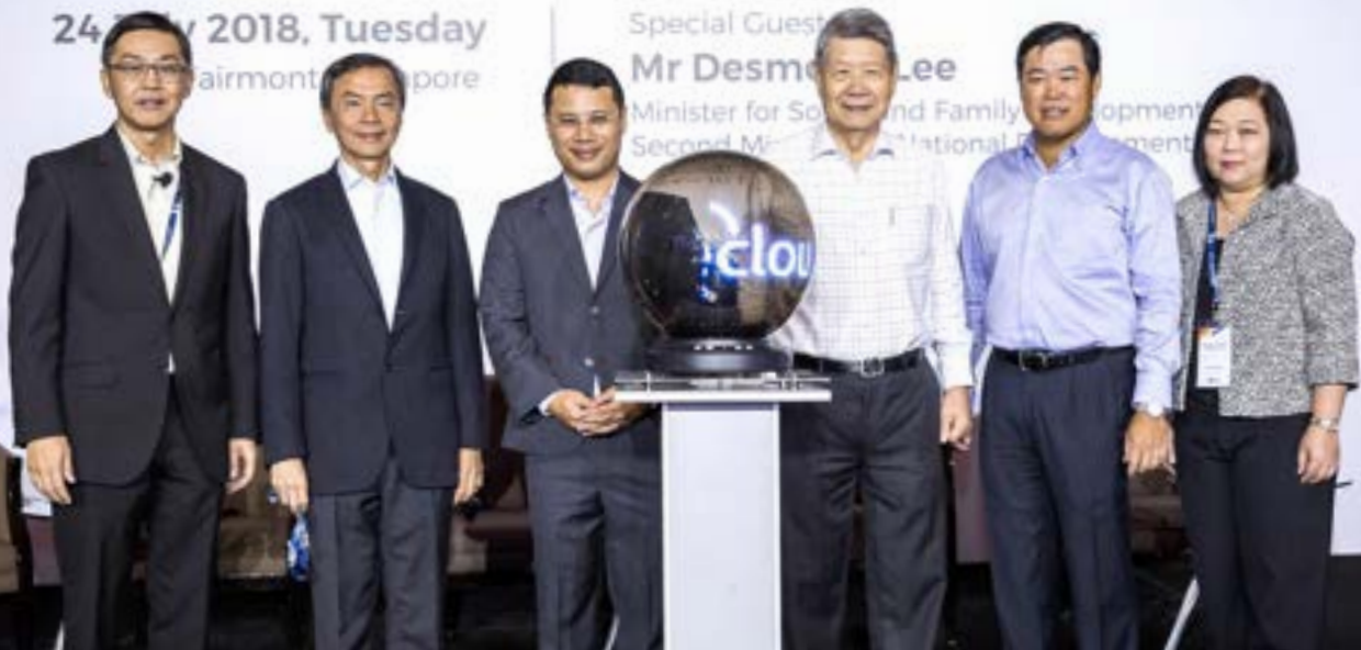
Launching iShine Cloud, Mr Lee, Minister for Social and Family Development, said: "Initiatives such as the iShine Cloud can help our sector adopt IT and improve our work processes by aggregating common needs across VWOs". THE STRAITS TIMES, 25 JULY 2018

Special Guest Mr Desmond Lee Minister for Social and Family Development Second Minister for National Development