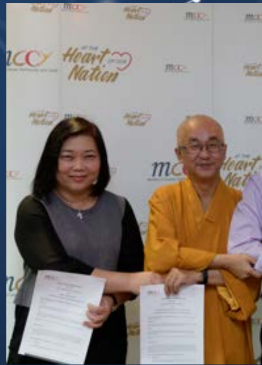
FOUR GROUPS TO PROVIDE CHARITIES WITH SHARED SERVICES, THE STRAITS TIMES, 25 MAY 2018